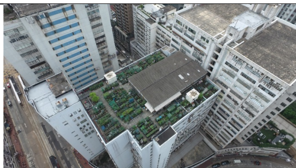
(3) Aerial Photo of Hong Kong's Oldest Rooftop Farm, in Quarry Bay

In addition to building type and age, data collected to determine the environmental and building limits for URF operations, included: farm location (rooftop / podium deck); rooftop height; means of access (by stairs or lift); roof size and farmed area; other roof uses (e.g. emergency refuge); structural capacity of the roof deck; parapet edge conditions; services / structures; roof drainage; water proofing; water supply; and sunlight / wind exposure. Examples of farms on industrial buildings are shown in images 3 & 4.