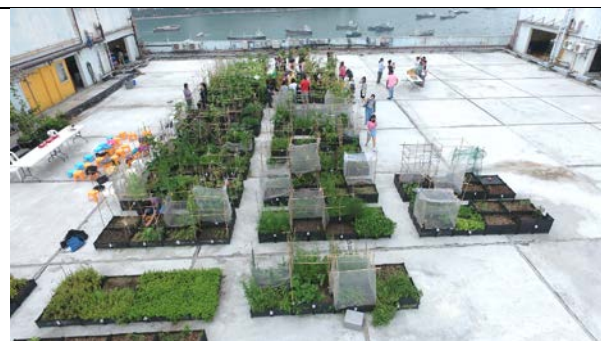
(4) Aerial Photo of the Newly Established City Farm, in Tsuen Wan

During each visit the farm manager / owner was interviewed to understand the history of the farm; building and farm ownership; the funding model and operational structure; the number of participants in the farm and their origin (specific community group or the general public); planter type and typical crop species; soil material and estimated weight; and related activities (instruction sessions, crafts etc.). Managers / owners were further invited to share their experience of the operating limits of rooftop farming.