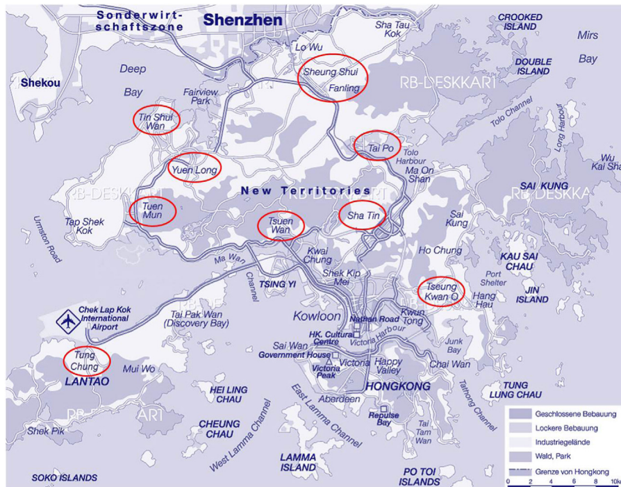
Fig. 1 Hong Kong district map 2013. Note: The nine new towns are marked by circle.

density of 6620 persons per km 2 (CSD, 2013a). As illustrated in Fig. 1, the city comprises Hong Kong Island (the Island), the Kowloon Peninsula (Kowloon), and the New Territories. The three major regions collectively occupy a land area of 1104 km 2 . With only 20% of the areas being naturally developable (Yeung and Wong, 2003), most of the remaining developed lands are created through reclamation.