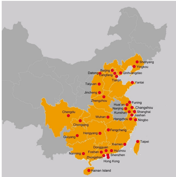
Foxconn locations in greater China, 1974-2015. Foxconn has more than 30 factories across China. In many cities, Foxconn runs multiple manufacturing facilities. Sources: Foxconn Technology Group company websites and annual reports.

China has more than 13,300 registered vocational schools and colleges ( Xinhua 2015). In 2014, approximately 18 million full-time students were enrolled in secondary vocational schools across the country. The government projects an increase in vocational school enrollment to 23.5 million by 2020 (not including those in vocational colleges or adult vocational education) (Ministry of Education of the People's Republic of China 2010a, table 1). Upon completing nine years of compulsory education, students can compete to continue their studies in general track high schools or enroll in vocational institutions. The age of admission to standard three-year vocational schools is often as young as 15. While students in high schools are prepared for university entrance, those in vocational schools are trained for skilled work or higher vocational education.