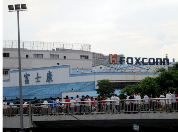
The majority of Foxconn's more than one million workers are rural migrants and teenage student interns. Fushikang, headquartered in Taipei (registered as Hon Hai Precision Industry Company), literally means "wealthy" and "healthy" in Chinese. Photographs taken during field trips to Guangdong and Sichuan (2011-2014).

Our primary research is based on multiple fieldtrips to Foxconn's largest assembly facilities in Sichuan (Chengdu City) and Guangdong (Shenzhen City) between 2011 and 2012, and follow-up visits in Shenzhen in August 2014, supplemented with inquiries made to senior company executives between December 2013 and April 2014. 1 Drawing on interviews with 38 interns and 14 teachers, who were dispatched from eight vocational schools (based in Sichuan and Henan provinces) to Foxconn factories for internships, we also conducted documentary analysis of the Henan government's major policies on student internships and employment. There has been scant scholarly attention to student interns as temporary or contingent labor, leaving unexamined an important dimension of the precarity of Chinese labor that is the product of the triangular relationship linking capital, the local state, and vocational schools in internship programs. In the following we review the changing labor market and ongoing legal reforms and structural transformation in China. We then present the findings of our study of the Foxconn internship program, and conclude by assessing the corporate and government responses to student labor abuses.