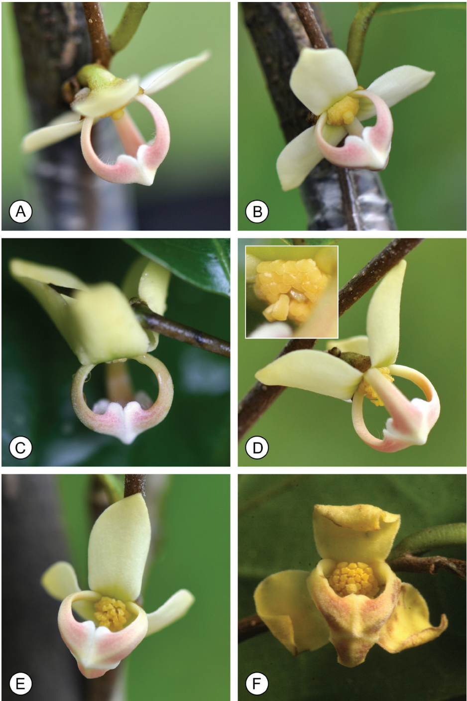
Figure 2. Mitrephora monocarpa sp. nov. ( P. Chalermglin 581215). A, B Pistillate-phase flowers C–E staminate-phase flowers (insert in D shows abscised stamens suspended by tracheary elements in the xylem) F late-stage flower, with petals turning yellow.