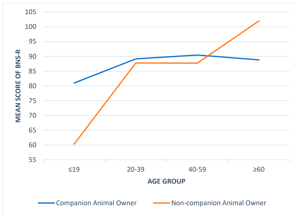
Figure 1. The comparison between owner and non-owner on BNS-R among age groups.