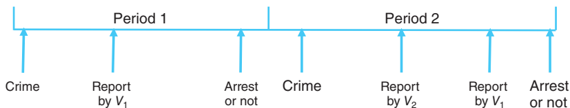
FIGURE 1. THE TIMELINE WHEN A IS GUILTY

Notes: This figure shows the case in which A strikes a victim in each period. If there is no crime, there is no reporting decision. If there is no report, there is no arrest decision.