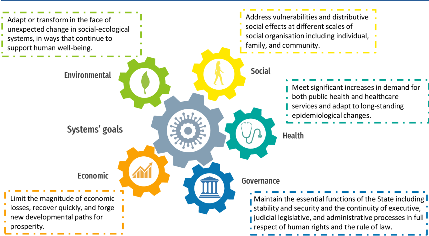
Figure 1 Interconnected societal systems and their different goals in addressing the COVID-19 pandemic.

governance functions and minimising any undesirable systemic effects. This definition encompasses the capacities of societies to (1) prepare, prevent and protect before disruption; (2) mitigate, absorb and adapt during disruptions; and (3) restore, recover and transform after disruption. <sup>6</sup>