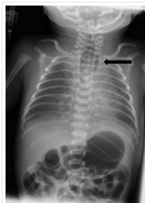
FIG 1. A 1.5-kg baby girl delivered at 35 weeks gestation. Plain radiograph taken at birth showing the orogastric tube (arrow) coiled at the proximal oesophageal pouch with distal bowel gas

After surgery, the patient was managed in the neonatal intensive care unit according to our usual protocol. On day 1 after surgery she developed sudden profound desaturation with CO 2 retention when the endotracheal tube was secured at 8 cm