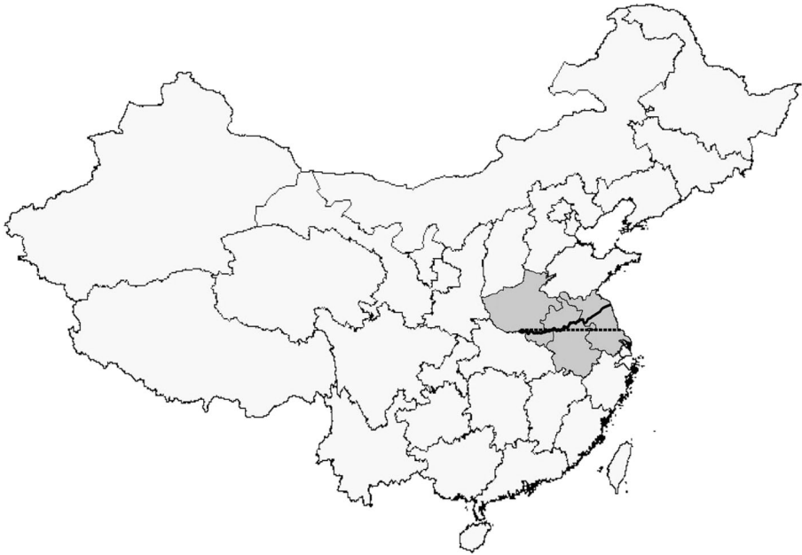
Fig. 1 Heating policy: Huai River. From east to west, the boundary of the heating policy follows the Huai River (solid line). To the west of Huai River, the boundary follows the Qinling Mountains, which are sparsely populated. Thus, we focus on the Huai River part of the heating policy boundary, which runs through Jiangsu (right), Anhui (center), and Henan (left). The 32.5 degree north latitude is represented by the dashed line