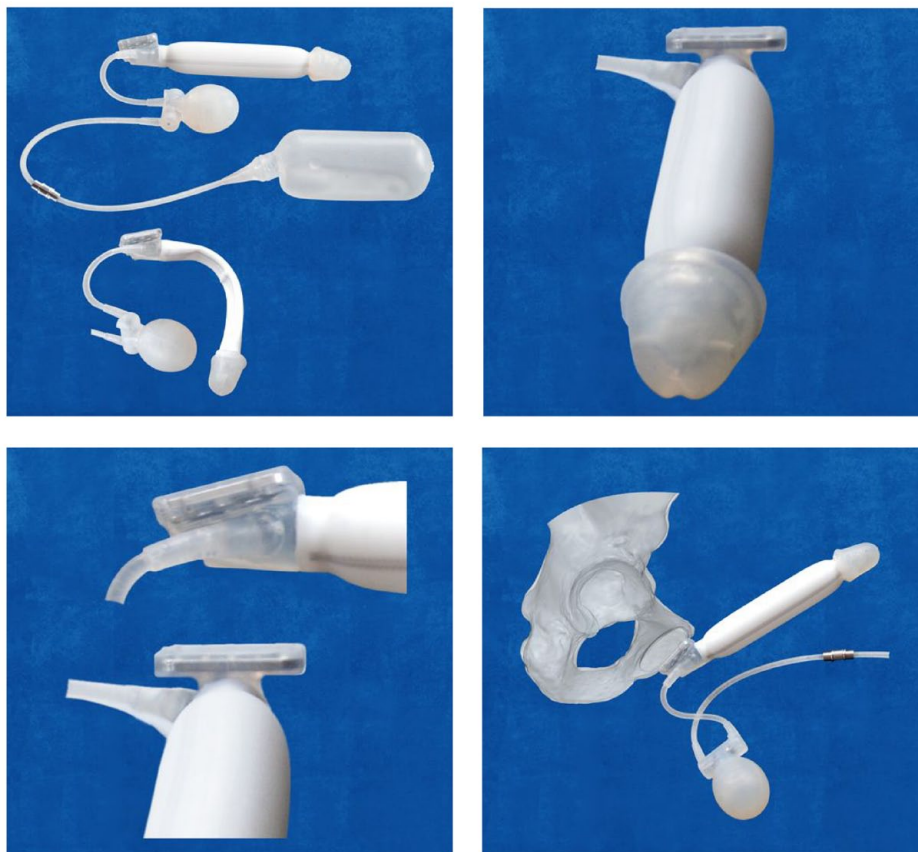
Figure 2. ZSI 475 FTM penile prosthesis.