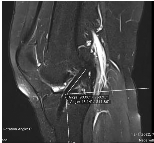
Figure 1. Sagittal graft angle on postoperative MRI. The T2-weighted sagittal cut that best showed the whole graft was selected for measurement. The longitudinal axis of the proximal tibia was identified. Two circles were drawn in the proximal tibia, each touching the anterior and posterior tibial cortex. The longitudinal axis of the proximal tibia was identified by connecting the centers of these 2 circles. The angle formed by the perpendicular to the proximal tibial axis and the longitudinal axis of the ACLR graft was determined to be the sagittal graft angle. ACLR, anterior cruciate ligament reconstruction; MRI, magnetic resonance imaging.