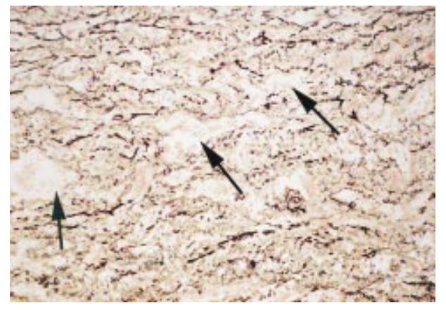
Figure 2 Case 1: histology of aneurysmal pulmonary arterial wall. Elastic van Gieson stain. Notice fragmentation and associated loss of the elastic fibres with increased ground substance in these areas, indicated by black arrows.

arteriosus was closed. In the pulmonary artery there was no intimal tear, medial dissection, or calcification. Histology showed medial degeneration and fragmentation of the elastic fibres with increased ground substance but no loss of smooth muscle cells or inflammation (fig 2). At six months' follow up, her symptoms had improved significantly and her right ventricle was only moderately dilated with a pressure of 46 mm Hg.