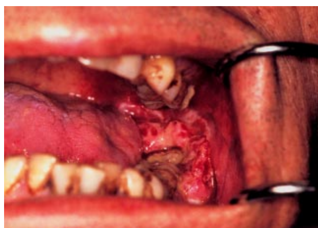
Fig 5. Invasive squamous cell carcinoma on the posterior mandible in a 66-year-old smoker

had only a weak correlation with oral cancers and genetic polymorphism of GSTT1 , CYP1A1 , and CYP2E1 genes were not associated with such cancers. 61 Retinoids or beta-carotene, isothiocyanates and tea polyphenols have also been identified as possible chemo-preventive agents for cancers of the lung and oral cavity, but study results remain controversial. 60 More molecular epidemiological evidence is required to confirm the gene-to-gene and gene-to-environment interactions in the development of oral cancers influenced by the different forms of tobacco smoking, especially among different ethnicities and races.