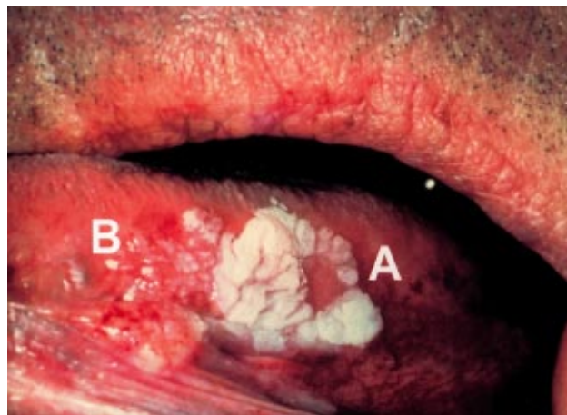
Fig 4. Tongue lesion with (A) epithelial dysplasia at the whitish area and (B) carcinoma at the ulcerative area

Carcinogenesis of squamous cell carcinoma in the lung and oral cavity due to carcinogens present in tobacco and tobacco smoke may be correlated. Genetic polymorphisms of glutathione synthesis and glutathione-dependent enzymes have been studied with respect to the susceptibility to lung cancer. 59 Genetic combinations, such as mutations in the gene encoding cytochrome P450 ( CYP ) 1A1 and the GSTM1 -null genotype, may predispose the lung and oral cavity of smokers to an even higher risk of carcinogenesis or DNA damage. 60 Major classes of carcinogens present in tobacco and tobacco smoke can be converted into DNA-reactive metabolites by CYP -related enzymes, but a study conducted in Japan showed that the GSTM1 -null genotype