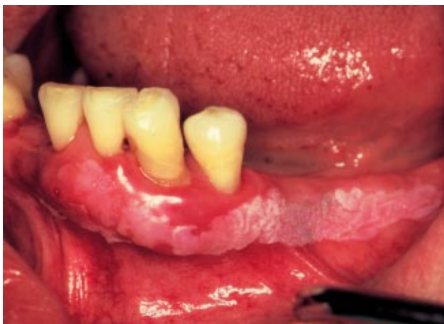
Fig 3. Homogenous leukoplakia on the left alveolar gingiva of the mandible