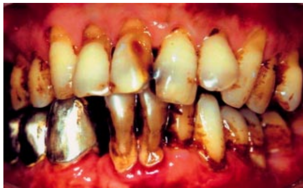
Fig 1. A heavy smoking subject with generalised chronic periodontitis

Acute necrotising gingivitis is also strongly correlated with tobacco use. 18 Although the precise cause of this disease remains unknown, it tends to occur most frequently in teenagers and young adults. Some patients with acute necrotising gingivitis have defective neutrophil function, thereby allowing bacterial, or possibly viral (cytomegalovirus) invasion of gingival tissues. 19 The gingival bleeding in smokers is 'less severe' than in non-smokers, which could be related to the vasoconstrictive effect of the nicotine. 20 The main vasoconstrictive property of nicotine exerts its effect at the end-arterial vasculature of the gingivae, 20 and