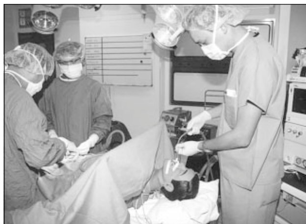
Fig 1. Full-scale clinical simulation environment at the Institute of Clinical Simulation

Anticipation and planning Communication Leadership and assertiveness Use of all available resources Distribution of workload and mobilisation of help Re-evaluation of situations Use of all available information and cross-checking of redundant data