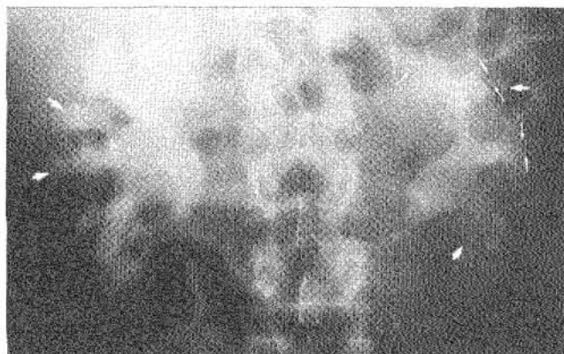
Figure 4: Same radiograph as Figure 2 with the addition of arrows. Both pelvicalyceal systems are opacified by contrast. Tiny cysts (arrowheads) and streaks (small arrows) are present within the enlarged medullary papillae

This disease may affect the whole or part of one or both kidneys. Unilateral involvement is present in 25% of cases. It typically affects young to middle-aged adults, and has an incidence of 0.5%. Uncomplicated disease is usually clinically silent. Secondary infection or passage of calculi, such as in our patient, may produce symptoms. Obstruction by calculi or repeated infection may lead to impaired renal function. Medullary sponge kidney may be associated with Ehlers-Danlos syndrome, parathyroid adenoma or Caroli disease. 1-3