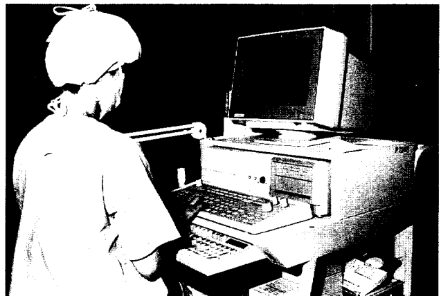
Fig 2. The machine used for intra-operative spinal chord monitoring at the Duchess of Kent Children's Hospital

In two patients with scoliosis, there were marked reductions or even disappearance of the wave forms after the corrective force was applied during surgery; the force was released immediately. In both cases, the evoked potentials recovered gradually after 15 minutes. A subsequent corrective force was re-applied cautiously and slowly with the potentials being carefully monitored. Neither patient woke up with a neurological deficit. A typical example is shown in Fig 4. We did not encounter any false negatives.