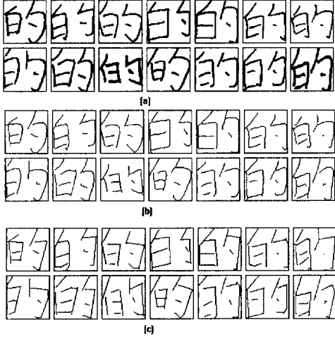
Figure 2: (a). Original characters. (b). Skeleton of the characters. (c). Stroke extraction result.

perform all the computation in equation (11). In fact, as the relaxation matching is a process that makes local contextual information to search for an optimal matching, when stroke a_i is matched with stroke b_k , only those strokes which are contextual related with a_i and b_k are needed to be considered. A contextual association matrix which indicates the contextual relationship between pairs of stroke in a character is defined as :