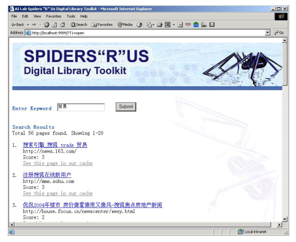
Figure 2. Example of a Chinese search engine built by SpidersRUs.