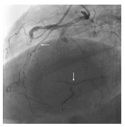
Panel B Coronary angiogram in left anterior oblique view showing a sudden variation of collateral circulation to the distal right coronary artery (RCA), with good opacification of the RCA branches (Rentrop 3). White arrows point to the left anterior descending artery and the RCA.