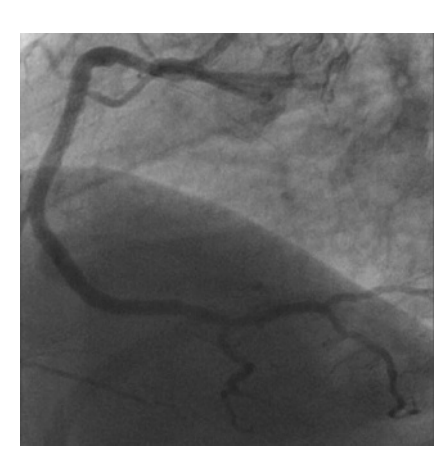
Panel C Coronary angiogram in left anterior oblique view showing the final angiographic result after multiple drug-eluting stent deployment.