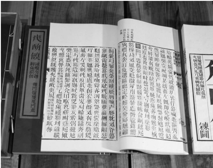
7 Xu Bing, 'Book from the Sky' (detail), 1988

that occurred in the 1980s. Before the end of that decade a great deal of artistic experimentation had taken place, such as that in the supportive environment offered by the Hangzhou Academy of Art, and in 1989, shortly before the crackdown in the wake of the student protests of that year, there was a large-scale breakthrough exhibition of avant-garde work at the China Art Gallery in Beijing. 6 Xu Bing (b. 1955) had by this time already created his Book from the Sky (1988), a conceptual installation in which thousands of well-formed but meaningless Chinese characters are printed from hand-carved wooden blocks onto the surface of paper (see figure 7). Following the Tiananmen massacre this head-on Dada-like confrontation with tradition was imbued with further, more explicitly political, layers of connotation, and a cynical mood was often to be found in the art that was produced in the early to middle 1990s, a fertile time for art production, even if display of such experimental work within China itself was all but impossible until much later. The paintings of Fang Lijun (b. 1963) were peopled with aimless, clone-like figures, completely at odds with the new official mood of optimism over economic growth (e.g. Series II, No. 2 , 1992; see figure 8), while Wang Guangyi (b. 1956) produced a series of canvases that directly addressed the newly emerging consumer society. Juxtaposing the now-obsolete visual