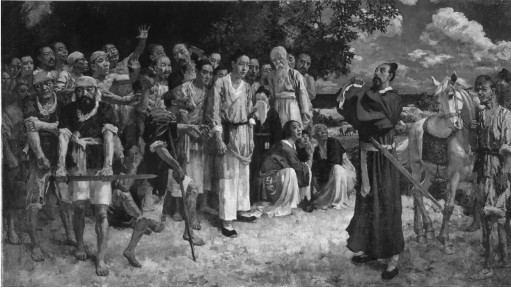
1 Xu Beihong, 'Tian Heng and his 500 Retainers', 1928–30

such as Tian Heng and his 500 Retainers (1928–30) (see figure 1). In this painting Xu depicts Tian Heng, a heroic figure who chose to commit suicide rather than capitulate to the first emperor of the Han dynasty, as he takes leave of his followers for the last time. Even Xu, however, chose to also produce works in a more stylistically hybrid idiom by creating ink paintings that retained a Western-influenced sense of volume (for example, in his many images of horses). Gao Jianfu's output is less heterogeneous at the level of medium than Xu's, and his ink paintings allowed him to incorporate Western understandings of volumetric form without producing works that looked too obviously non-Chinese. Even Gao was to find difficulties in balancing the desire to retain a sense of relation to the ink-painting heritage (important even for a non-traditionalist painter such as Gao because of its national connotations) and a desire to incorporate modern-life subject matter of a kind not previously seen in Chinese art. In Flying in the Rain (1932), for instance (see figure 2), he depicts a group of biplanes (thus introducing connotations that are both explicitly modern and linked to political nationalism due to the fact that Sun Yat-sen had emphasized the importance of aviation for the country's strength), but places them towards the rear of the painting's space lest they disrupt too violently the compositional format expected of a Chinese landscape painting.