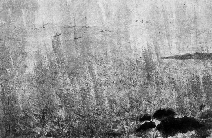
5 Fu Baoshi, 'Heavy Rain Falls on Youyan', 1961

the apparent negativity of the first stanza, or clarify it as a reference to a now-surpassed historical era.