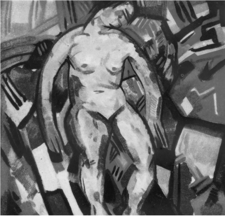
3 Lin Fengmian, 'Exercise', c. 1934

of the Republican period was Yi Feng , which featured both Western and Chinese art of a variety of styles. Much modernist art was reproduced and discussed in its pages: it published a translation of André Breton's Surrealist Manifesto of 1924, for instance, as well as a colour illustration of Lin Fengmian's Exercise (c. 1934), in which the artist shows awareness of the heightened and non-naturalistic colour schemes of European modernism, and adopts an angular stylization of forms that is reminiscent in particular of Cubism (see figure 3).