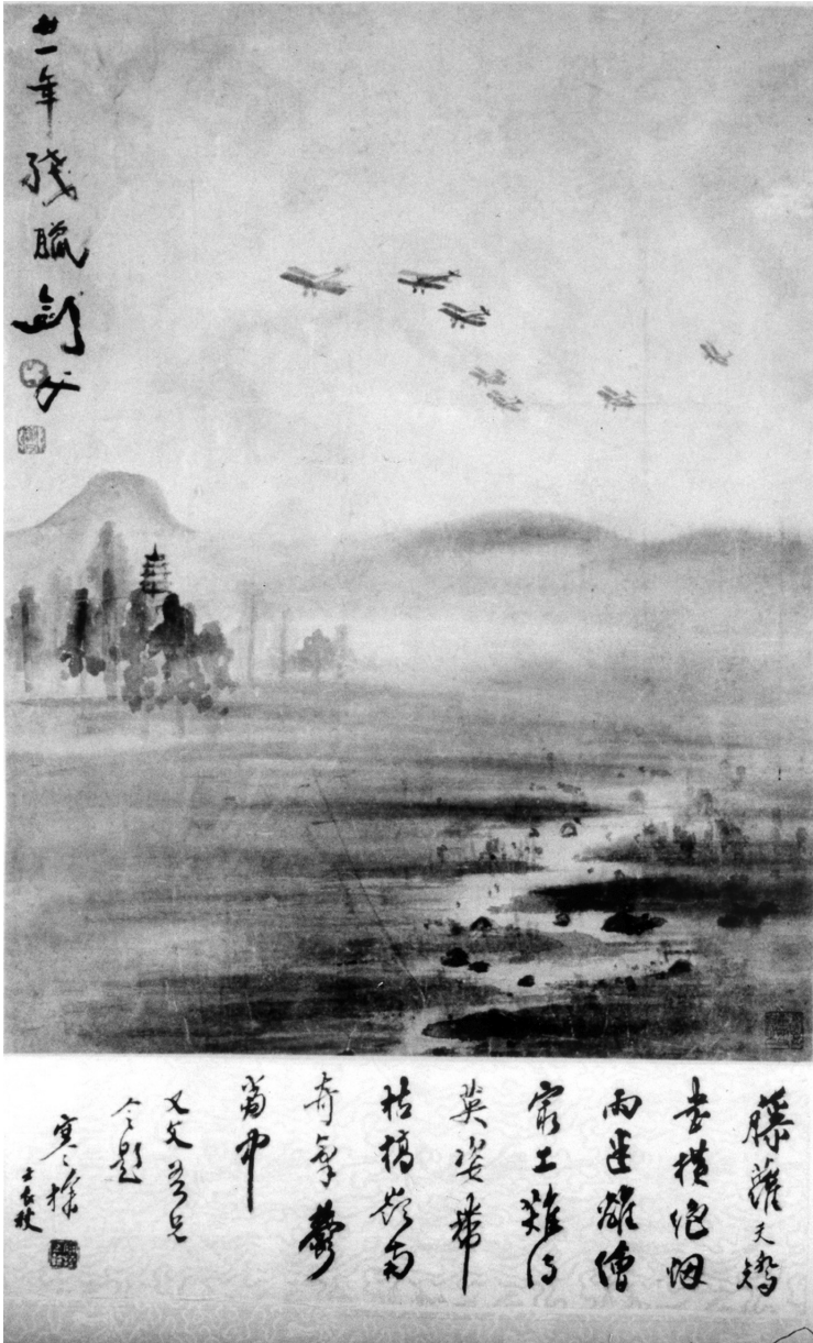
2 Gao Jianfu, 'Flying in the Rain', 1932