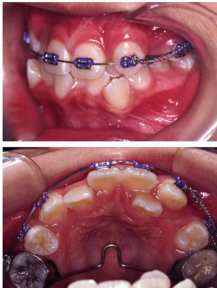
Figure 4 Nine months into treatment. Upper left canine (23) was retracted on 0.019 × 0.025-inch stainless steel wire with a nickel-titanium coil spring.

measurements did not change significantly. A functional and good-looking occlusal result was achieved. The patient was satisfied with her teeth and profile.