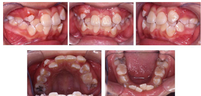
Figure 1 Pre treatment intraoral view.

Due to the severity of crowding, the first option of treatment plan was to extract all the first premolars (14, 24, 34, 44) to provide space for alignment and correction of the dental midlines. Due to high anchorage demand and a large amount of root movement involved, an alternate treatment option was to extract both upper canines (13, 23) and lower first premolars (34, 44). The advantage of the latter option is the reduction in overall treatment time. The disadvantages are compromised aesthetic, difficulties