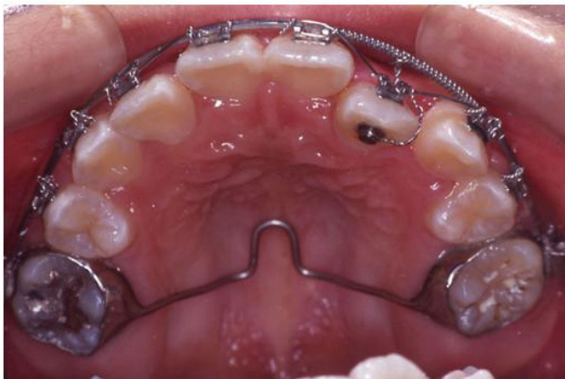
Figure 5 Piggy back technique to align the in-standing. The in-standing upper left lateral incisor (22) was brought to the arch with piggy back technique.

The 48 months of treatment time may seem longer than average, but patients with ectopically positioned canines are perceived to be more time-consuming to treat than average orthodontic patients. It is of utmost importance