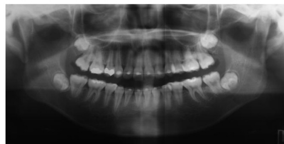
Figure 7 Post treatment panoramic radiographs. Post treatment panoramic radiograph showed reasonably root parallelism.