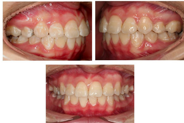
Figure 6 Post treatment intraoral views. Figure illustrates good occlusion and pleasing gingival contour.

in this case is to minimize undesirable side effects like the reactive moments on the anchor teeth, unwanted roots contacts and root resorptions. The anchorage on the transpalatal bar was possible to control the movement of the molars. With gentle, careful activation of archwire every visit, the amount of rolling of the round wire in the bracket or tubes will be negligible. Roots contact that may be caused by palatal root torque of canines can be avoided by carefully evaluating the proximity of the roots of the