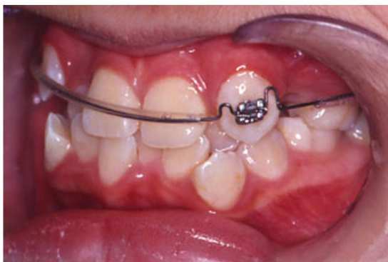
Figure 2 The modified 2 by 1 appliance: Left buccal segment-note the root of upper left canine (23) in mesial position.

Extraction of lower first premolars (34, 44) and placement of pre-adjusted appliance at the lower arch at the 18 th month treatment. To prevent dumping of the lower inci-